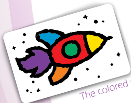
The colored side

Each card has a colored drawing on one side and the same drawing but in black-and-white on the other. Each drawing is divided into six areas .